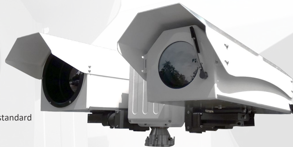
Above: Typical Jaegar Searcher, wiper optional (models will vary)

* Requires the NexOS performance pack and the gyro options